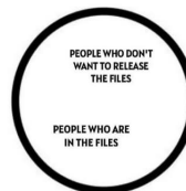
A VENN DIAGRAM

CURRENT OFFICE HOURS Saturday 11 am-2 pm