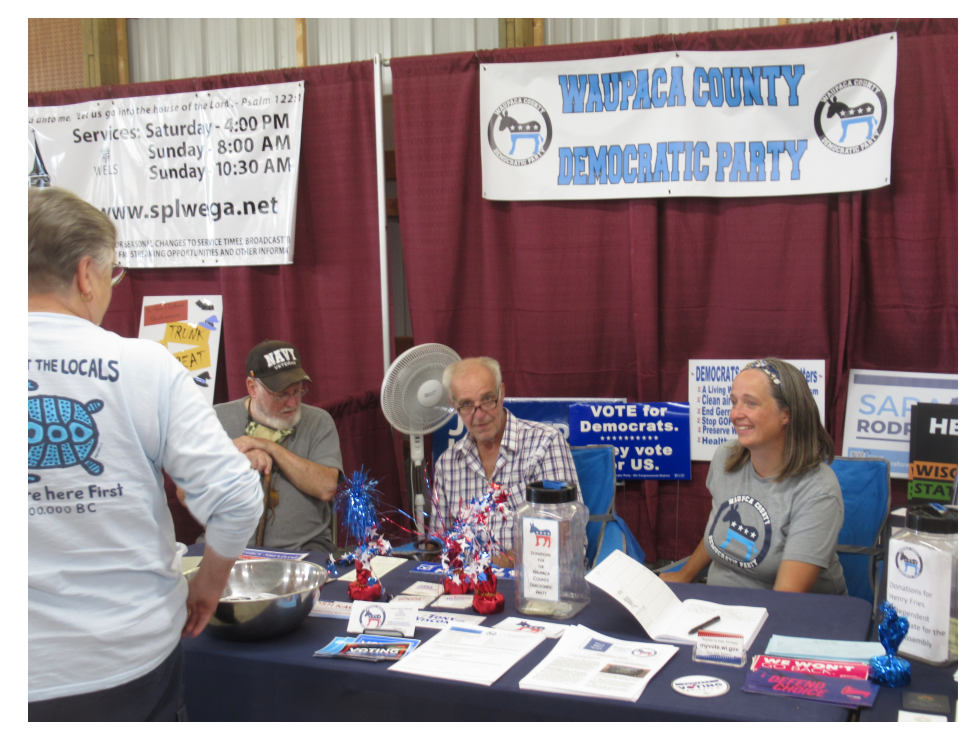
The people had things to say during the Waupaca County Fair, Aug. 25-28, 2022. Above left, farm animals conveyed a strong Democratic stance. Left, Targhee sheep were named after the Targhee National Forest, which surrounds the U.S. Sheep Experiment Station in Idaho. A young competitor's dad had this to say on his T-shirt: "Never hope for something harder than you're willing to work for it." Above, Executive Board members talked with a visitor at the booth in the Commercial Building. A favorite quote from a GOP visitor, when told that President Biden had won in November 2020: "We don't know that yet."